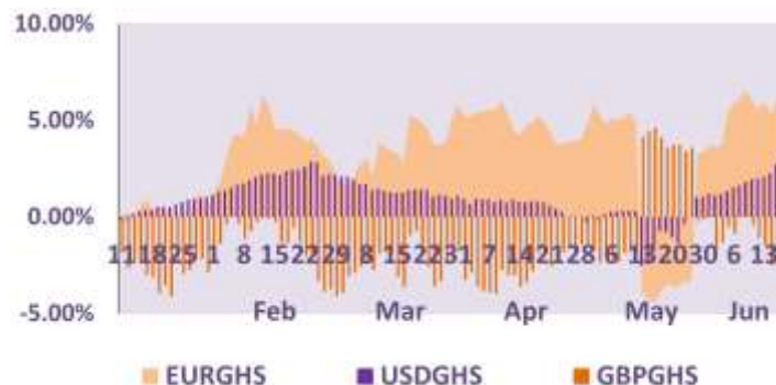
Fig 3: YTD performance of Pound, Dollar & Euro versus the Cedi

Consequently, the local currency trimmed down its year-to-date loss by about 0.2% to settle at 2.51%