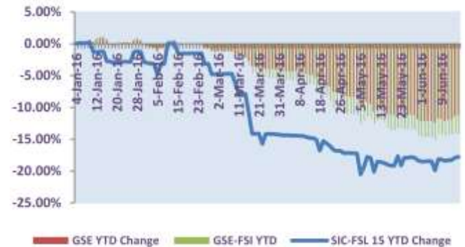
Fig 1: Year-to-date returns

The market capitalization also improved to GH¢54.33 billion from GH¢53.26 billion previously. However, corresponding dollar value declined to USD 13.94 billion from USD 14.02 billion because of depreciations in Ghanaian Cedi against the Dollar.