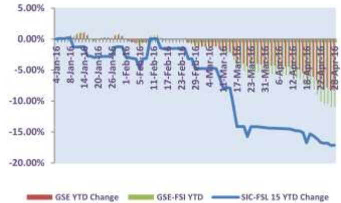
Fig 1: Year -to -date returns

Total market capitalization of the Ghana Stock Exchange also declined by 0.18% to GH¢54.43 billion from GH¢54.53 billion, whilst an equivalent dollar value surged by 0.41% to USD14.34 billion.